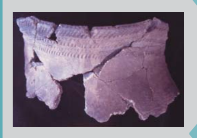
Reconstructed Native Pottery Vessel Kings Forest Park Site